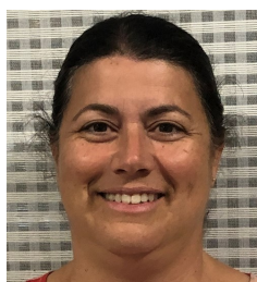
Caterina O'Loughlin Centre for Liturgy