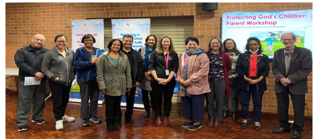
Protecting God's Children Workshop @ Thornlie Parish